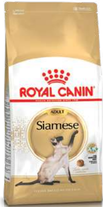
Available in 2kg, 4kg