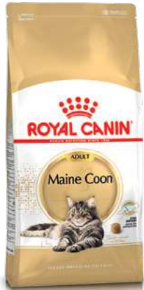
Available in 2kg, 4kg