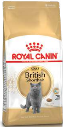
Available in 2kg, 4kg