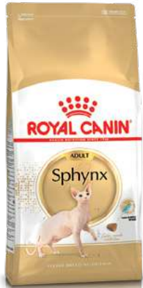
[ Available in 2kg ]